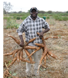
ETH PhD student harvesting cassava roots on a drought field trial in Kiboko (Kenya)