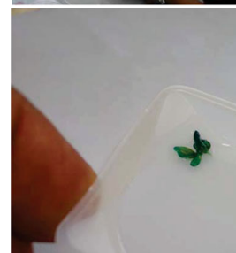
Tanzanian scientist using the ETH improved transformation protocol (above) and subsequent production of the first transgenic cassava at MARI (Dar es Salaam, Tanzania) (3)